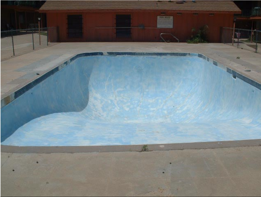
Ponderosa Apartments Pool #1: Preparation via sweep sandblasting and acid etch