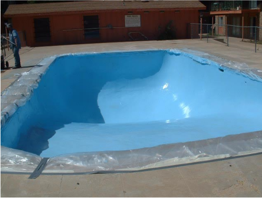
Ponderosa Apartments Pool #1: After application of CeRam-Kote 99P