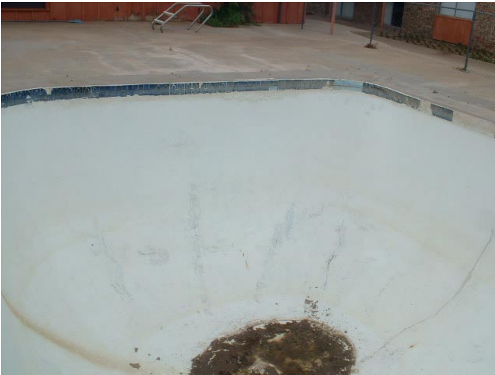
Ponderosa Apartments: Pool #1 Before application of CeRam-Kote 99P March 2003