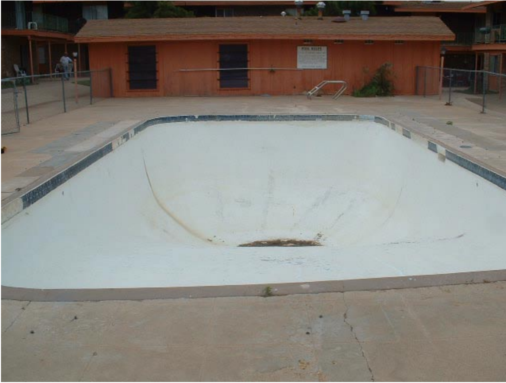
Ponderosa Apartments: Pool #1 Before application of CeRam-Kote 99P March 2003