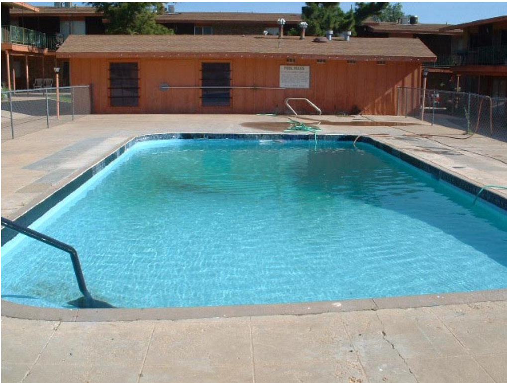
Ponderosa Apartments Pool #1: Application of CK-99P on pool. CK-99M in dark blue all around trim and Freecom manufactured hand railing.